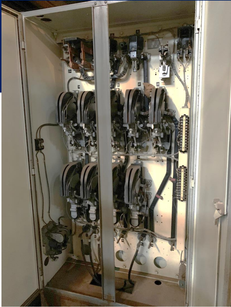
Nema Size 5, 65 HP, 230 Volt DC, Cutler Hammer Bridge Control Panel, Front Wired, 5-Speed, 900 Series Contactors, with BR Relay & Resistor (for 16" General Electric Shunt Brake Coil), mounted in Enclosure, complete with resistors mounted in fabricated steel racks