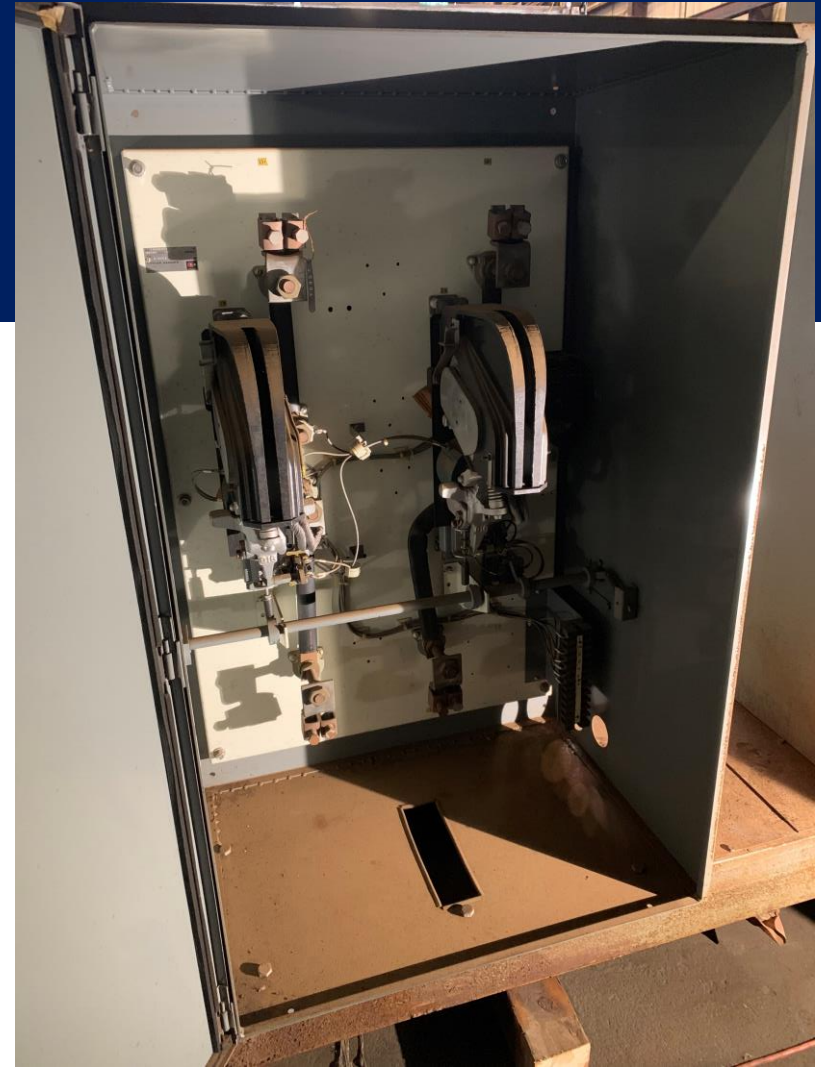
Nema Size 6, 600 Amp, 230 Volt DC, Cutler Hammer Manual Magnetic Disconnect Switch, Front Wired, mounted in Enclosure